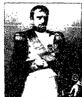
Had Napoleon carried a Citibank Classic Visa card with its Lost Wallet Service he would not have been compelled to hold on so obsessively to the wallet inside his jacket.

was a sign of advanced intelligence. ¶ The subsequent rise of services was nothing less than an American Revolution. So as you might expect, Citibank would be there for you, even if your card was stolen, or perhaps lost. The Lost Wallet™ Service could have a new card in your hands usually within 24 hours. (You can almost hear Paul Revere crying, "The card is coming! The card is coming!") ¶ When the Great Student Depression came along, Citibank introduced New Deals—special student discounts and savings. Hence, today's student can enjoy a $20 Airfare Discount for domestic flights 1 (ushering in the Jet Age); savings on mail order purchases, sports equipment, magazines and music; a low variable interest rate of 15.4% 2 ; and, no annual fee. ¶ Finally, comes the day you enter the Classical Age (i.e. when you charge your purchases on the Citibank Classic card). You receive Citibank Price Protection to assure you of the best prices. Just see the same item advertised in print for less, within 60 days, and Citibank will refund the difference up to $150 3 . You receive Buyers Security™ , to cover