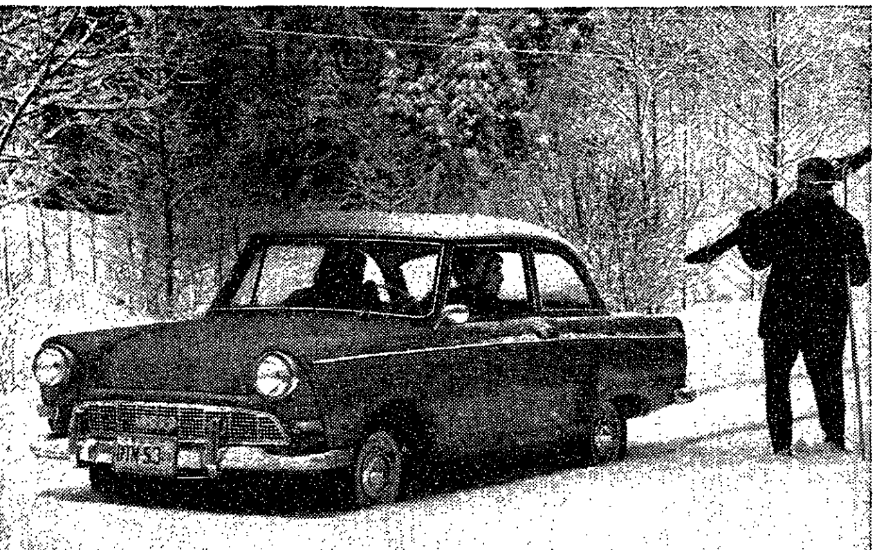
PHOTOGRAPHED AT MOUNT STRATTON, VT.