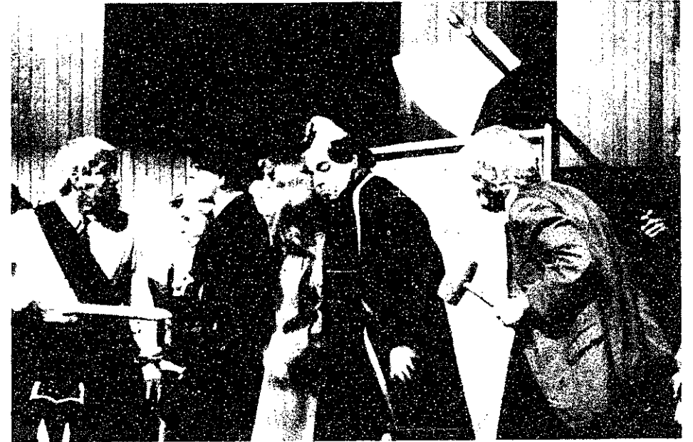
(center). Vigilantes attack to prevent depletion of Scotland's Scotch supply. (right)