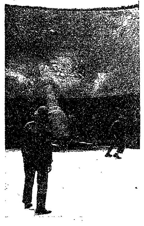
Stand Clear—The concussion makes proximity to the big mortars unpopular during firing.

fare), as passes will probably be granted from Saturday morning until Sunday evening. If not otherwise attracted you can find many points of interest within a few miles of New