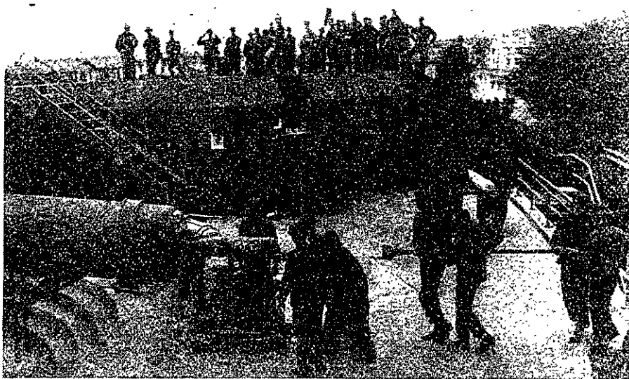
Loading a Big Fellow—A few students do the work for the edification of the watchers on the gun pits at Fort Monroe

There will be dances and other social functions within easy walking distance of the Camp. While it is called a Camp yet you will be comfortably housed in a permanent barrack. And as for eats, I expect that we shall have a hard time to get you away from the Camp on Sundays. The allowance for food is seventy cents