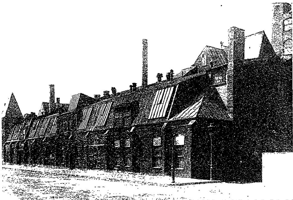
THE NOW EXTINCT COPLEY HALL

President William Barton Rogers, to whom Technology owes its strong foundation and high ideals. President Rogers' birthday is on December 7, and this day has for many years been known as "Founder's Day."