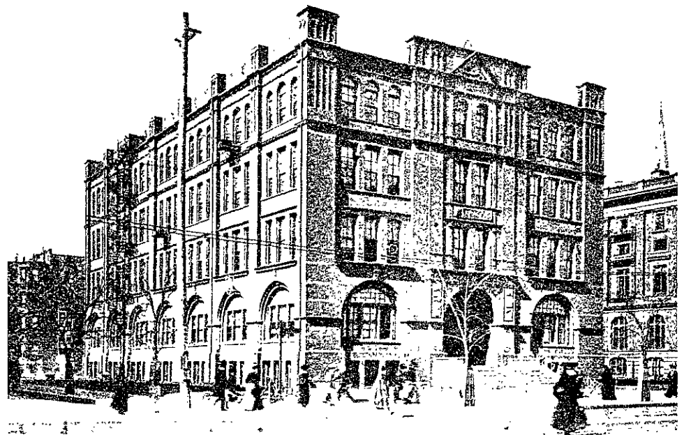
PAST HOME OF PHYSICS AND CHEMISTRY

The Old Walker Building was another of the old group of buildings near Copley Square.