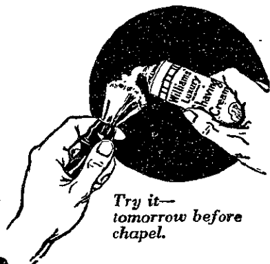
Try it—tomorrow before chapel.

—It must prepare your face for quick, gentle shaving. Williams' is so pure and wholesome that it actually helps the most tender skin.