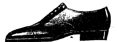
Exhibit Shops In all the larger cities

FRANK BROTHERS Fifth Avenue Boot Shop near 48th Street, New York Master-made Footwear