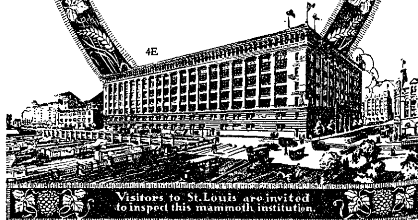
Visitors to St. Louis are invited to inspect this mammoth institution.