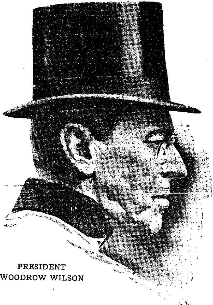
PRESIDENT WOODROW WILSON

Elections for the three upper classes and the straw vote for President of the United States will take place today from 8.30 A. M. to 4.30 P. M. in the Main Lobby; the results to be announced this evening at a Mass Meeting in the "Caf" instead of "Smith" Hall as stated on the ballots. In this same (Continued on page 2)