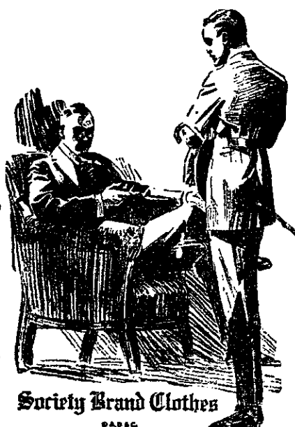
Society Brand Clothes