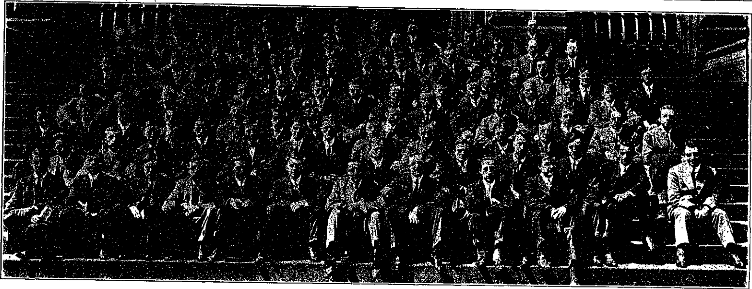
STUDENTS IN CIVIL AND SANITARY ENGINEERING.