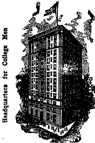
Headquarters for College Men