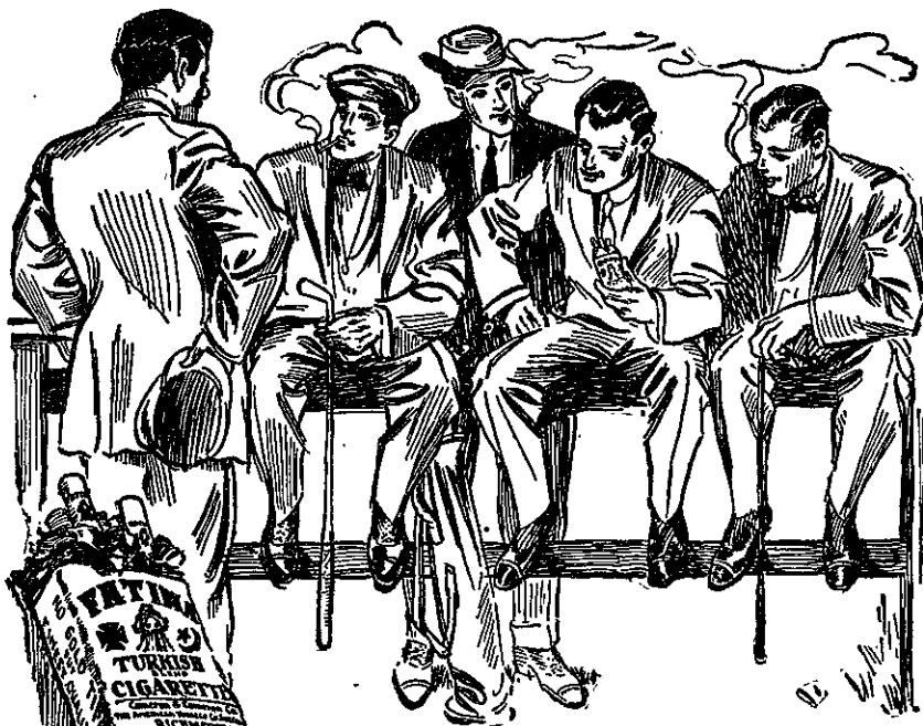
THE AMERICAN TOBACCO CO.

The smoke that pleases and satisfies. Perfectly blended Turkish tobacco. Inexpensively packed with ten extra cigarettes for your money.