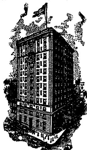
Headquarters for College Men