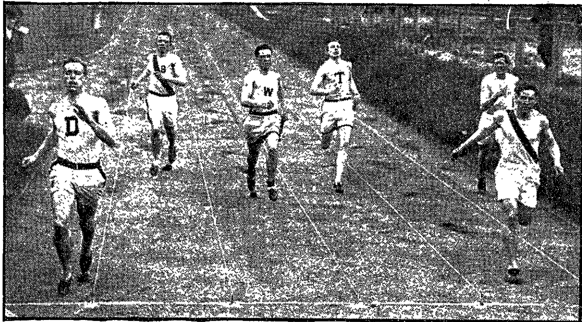
FIRST HEAT IN 220 YARD DASH.