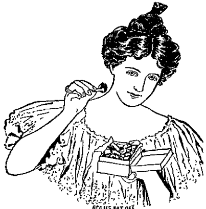
"Name on every piece."