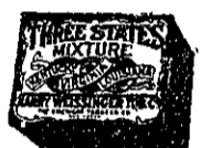
THREE STATES —A delicious blend of finest Virginia, Kentucky and Louisiana Perique Tobacco. 1 3/4 oz., 15c.; 3 1/2 oz., 25c.

Some one or more of these famous brands will just suit you and your pipe. If not found at your dealer's, sent postpaid.