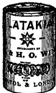
LATAKIA —Finest grade—heavily aromatic, fine for mixtures—in vacuum tins. 1 3/4 oz., 30c.; 3 1/2 oz., 60c.

He knows, too, that a good pipe, seasoned by and filled with one of these tobaccos, is better than the best smoke of any other kind.