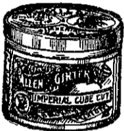
IMPERIAL CUBE-OUT —Mild, medium and full. The original cube-cut tobacco. Perique, Havana, Virginia, Turkish—in vacuum tins. 3/4 oz., 25c.