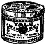
YALE MIXTURE —A very popular mixture—Havana, Perique, Turkish and finest Virginia selections. Sweet-flavored, mild and aromatic—in vacuum tins. 1 3/4 oz., 20c.; 3 1/2 oz., 40c.