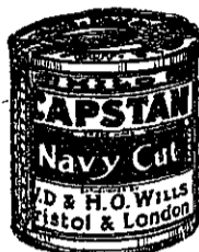
CAPSTAN —Mild, medium and full. The best navy plug cut in three strengths, heavy, medium, and mild—in vacuum tins. 1 3/4 oz., 25c.; 3 1/2 oz., 45c.