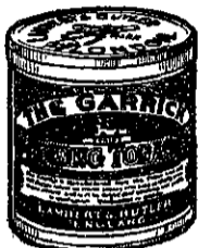
GARRICK —Finest imported mixture—Turkish, Latakia and Virginia, delightfully aromatic—in vacuum tins. 1 3/4 oz., 30c.; 3 1/2 oz., 60c.