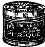
LOUISIANA PERIQUE —Allen & Ginter's famous brand of genuine St. James' Parish Perique—best for mixtures—in vacuum tins. 1 3/4 oz., 25c.; 3 1/2 oz., 45c.