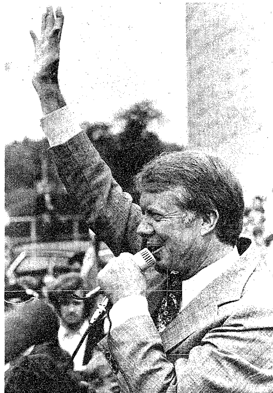
Democratic Presidential candidate Jimmy Carter addressed a crowd of 4,000 at Boston College yesterday.

The candidate arrived twenty minutes late at the Logan Airport Ramada Inn to speak at a private reception for area Democratic leaders and campaign staff. He spent the morning campaigning in Buffalo, and left for Portland, Maine immediately after his Boston visit.