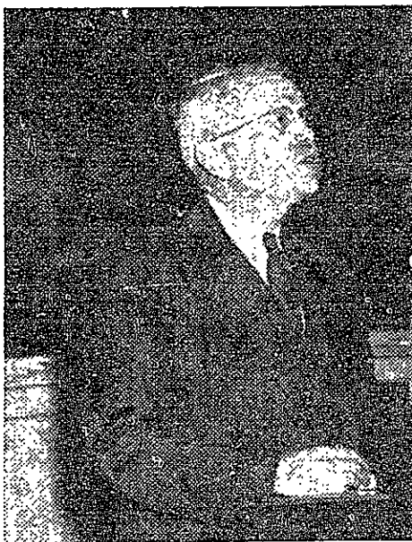
Prof. Harold C. Urey, who won the Nobel Prize for the discovery of heavy water, spoke to the faculty and students on World Government this week.