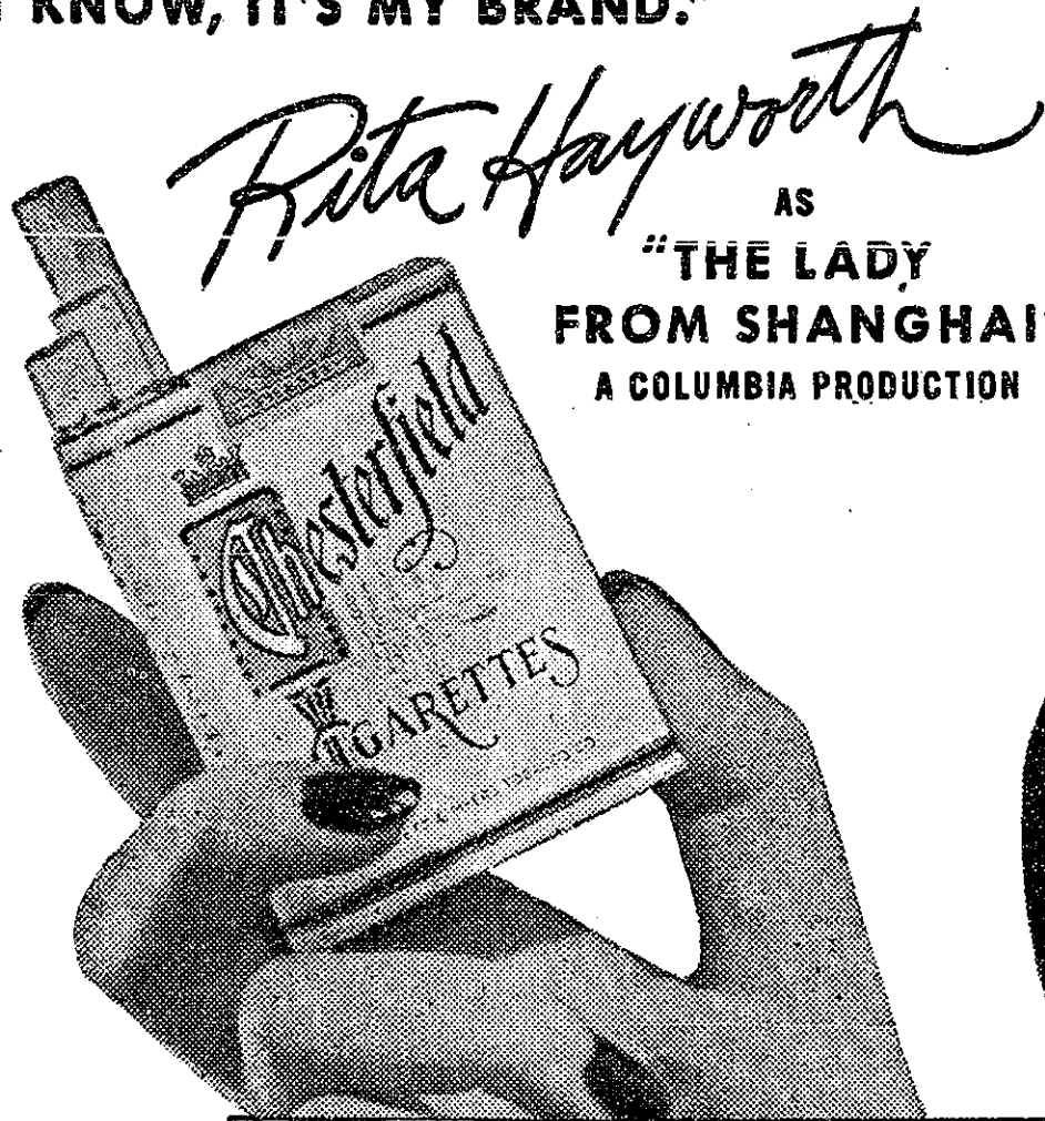
Rita Hayworth AS "THE LADY FROM SHANGHAI" A COLUMBIA PRODUCTION

"THERE'S NO FINER CIGARETTE THAN CHESTERFIELD. I KNOW, IT'S MY BRAND."