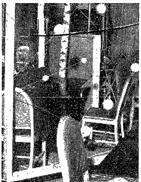
Surrounded by mysterious phallic symbols, this unfortunate young woman sits, not knowing what awaits her. She thinks she's going to get a soda!