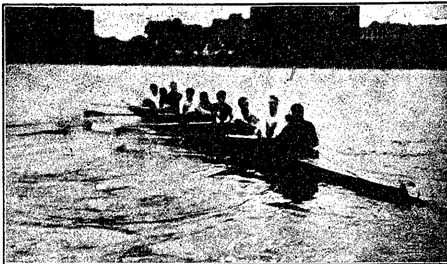
A Technology Crew shown sweeping down the Charles in a practice session