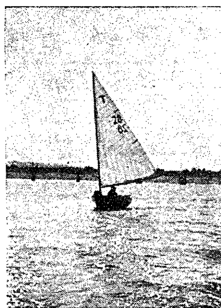
Dinghies Will Be at Camp