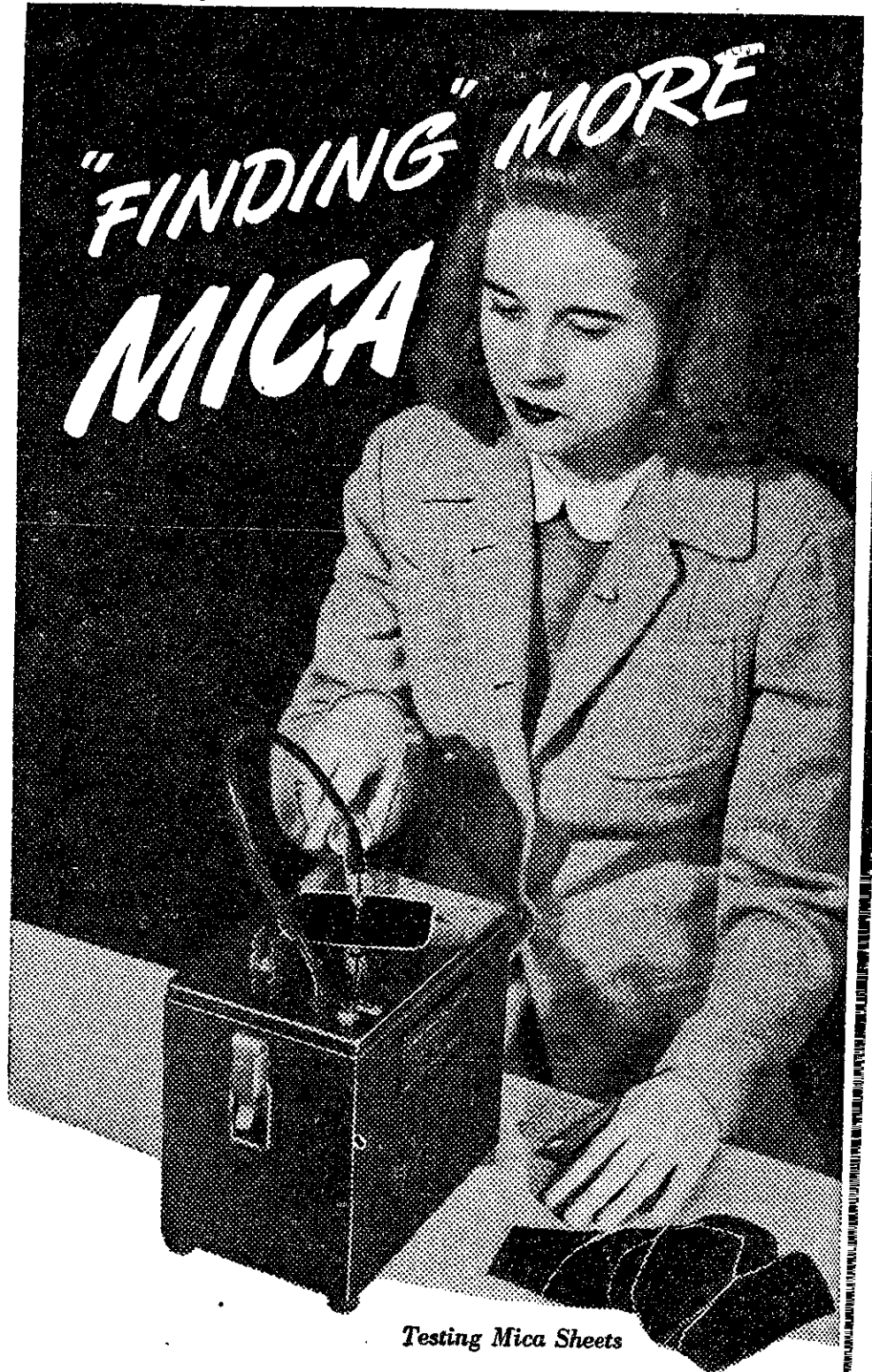
Testing Mica Sheets

The Hindustan Club will hold a dance on Friday evening, October 6, in Pritchett Hall. Real Indian food will be served for refreshments. The admission price is $.65.