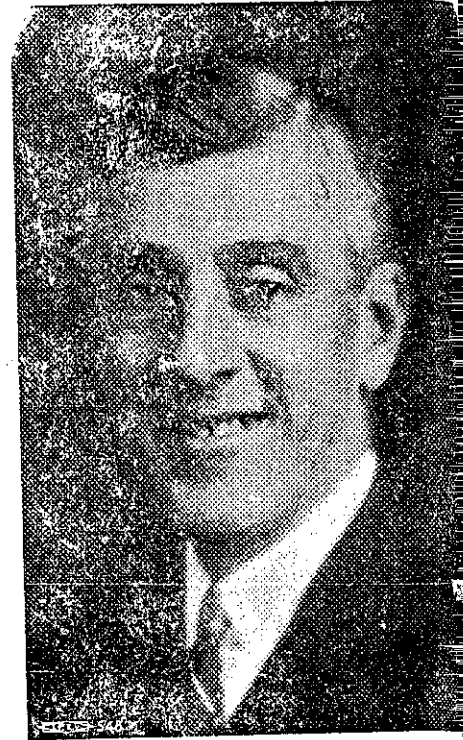
GOV. LEVERETT SALTONSTALL

Born 52 years ago in Newton, Leverett Saltonstall attended Noble and Greenough School in Boston before going to Harvard. His political career, during which he has been elected three times governor of this state and which now finds him as the Republican Candidate for the United States Senate, started in