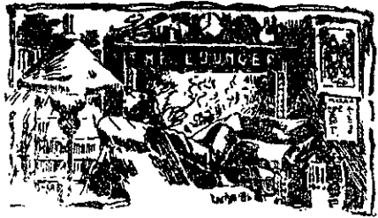
The Lure of the Unknown

the greater part of the Institute students are not from the Boston district, the A.S.U. has asked that all of the speakers confine their discussions exclusively to national problems such as foreign relations and policy, peace efforts, jobs and unemployment, civil liberty and democracy.