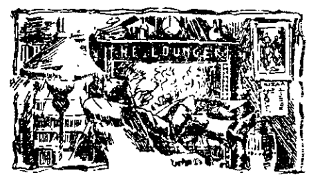
Let There Be No Light

Tickets for the inauguration banquet will go on sale in the Main Lobby of Building 10 on Wednesday, May 1 and will be sold to A.E.S. members and Course XVI men.