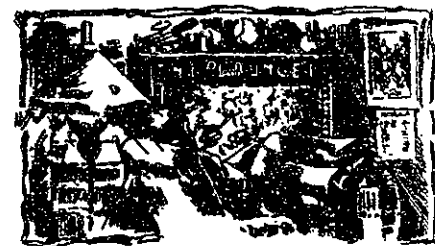
Incidentals In The Mail