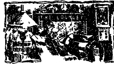
Vice Loses A Recruit

A persistent nuisance requires a deep and lasting cure for its removal.