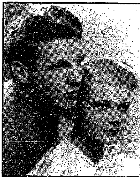
Ozzie Nelson and Harriet Hilliard who will furnish the music for the I. F. C. Dance, May 1st.