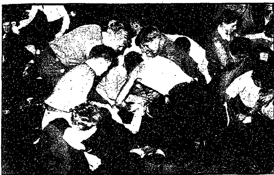
Freshmen Piling On Lone Soph