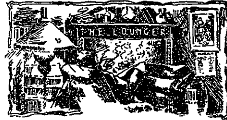
Truth is a woman; we must not use force on her.—Nietzsche.

In face of the short but notable record of rapid growth that the 5:15 Club presents, how is it possible for the rest of the student body to refrain from offering whole hearted support to the organization? For the non-member commuter, the 5:15 Club has much to offer for a small registration fee.