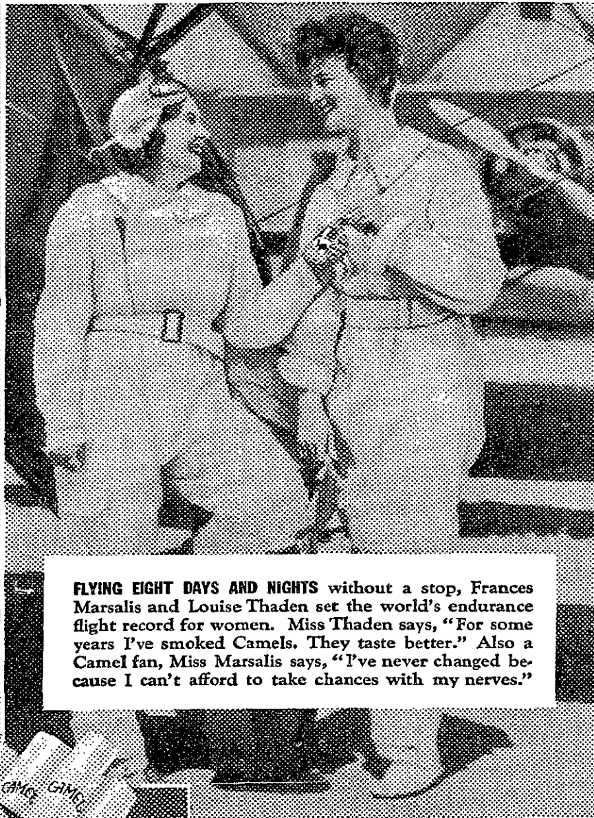
FLYING EIGHT DAYS AND NIGHTS without a stop, Frances Marsalis and Louise Thaden set the world's endurance flight record for women. Miss Thaden says, "For some years I've smoked Camels. They taste better." Also a Camel fan, Miss Marsalis says, "I've never changed because I can't afford to take chances with my nerves."