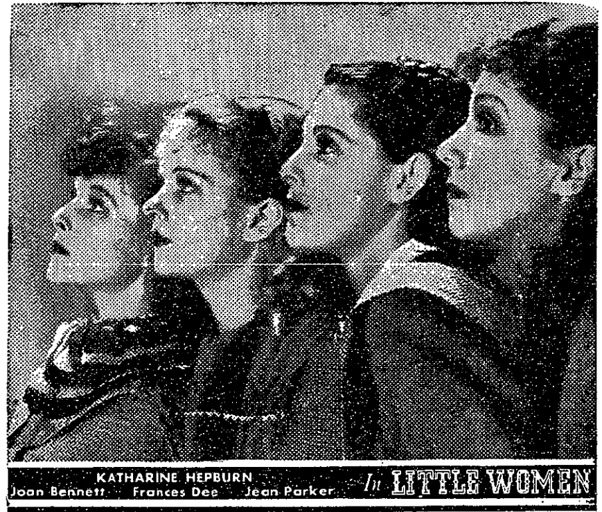
KATHARINE HEPBURN, Joan Bennett, Frances Dee, Jean Parker in LITTLE WOMEN

What is it at other colleges that creates spirit and an enthusiasm for the college and all it does? The answer is naturally enough, sports and activities. But you say, we have both of those at M. I. T. True, but they do not seem to create the proper interest. This fact is probably due to the inability to produce good enough teams, no matter how fine the material, with the very small amount of time now available for practice. The student body has become so used to seeing M. I. T. lose or show up badly that it has lost all interest in any sport whatever.