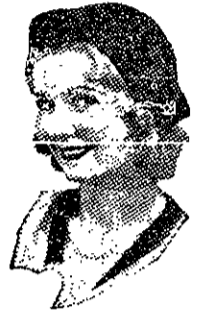
A pipe is not for girls

WOMEN don't smoke pipes. They're not the style for women. But pipes are the style for men, and more than that, a pipe and good tobacco gives a man greater smoking pleasure than tobacco in any other form.