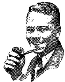
The favorite smoke of college men

Edgeworth is a blend of fine old burleys with its natural savor enhanced by Edgeworth's distinctive and exclusive eleven-step process. Buy Edgeworth anywhere in two forms—Edgeworth Ready-Rubbed and Edgeworth Plug Slice. All sizes, 15¢ pocket package to $1.50 pound humidifier tin.