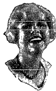
A pipe is not the smoke for girls