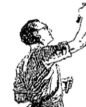
Du Pont chemical engineers insure uniformity of quality by chemical control through every step of manufacture from raw material to finished product.

DU PONT explosives do just what is expected of them—every time—because they are adapted to every blasting requirement and always of uniform quality.