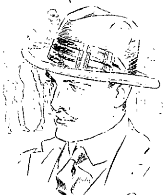
Ascot ENGLISH TOMMY BROAD BRIM SOFT

637 Washington St., At Boylston 659 Washington St., Gaiety Theatre 311 Washington St. Opp. Old South Church