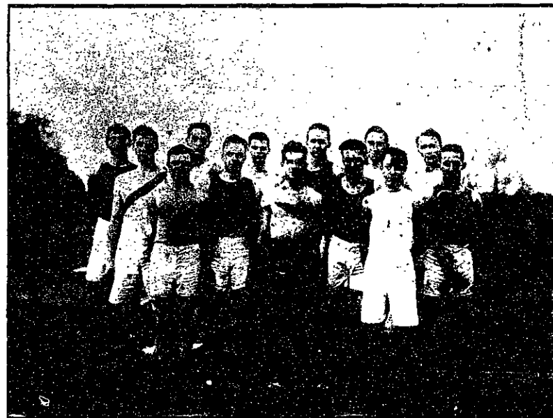
1916 RELAY TEAM

In case some of the men have not started their books, but have good ideas as to the plots, even outlines of what they have, will be sufficient to hand in,