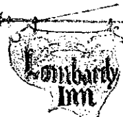
TABLE d'Hotel DINNER 5 to 8.30 A LA CARTE

STRICTLY ITALIAN CUISINE Italian Wines - Music