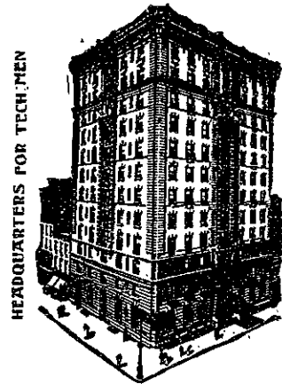
HEADQUARTERS FOR TECH MEN

Southwest cor. Broadway and Fifty-fourth St