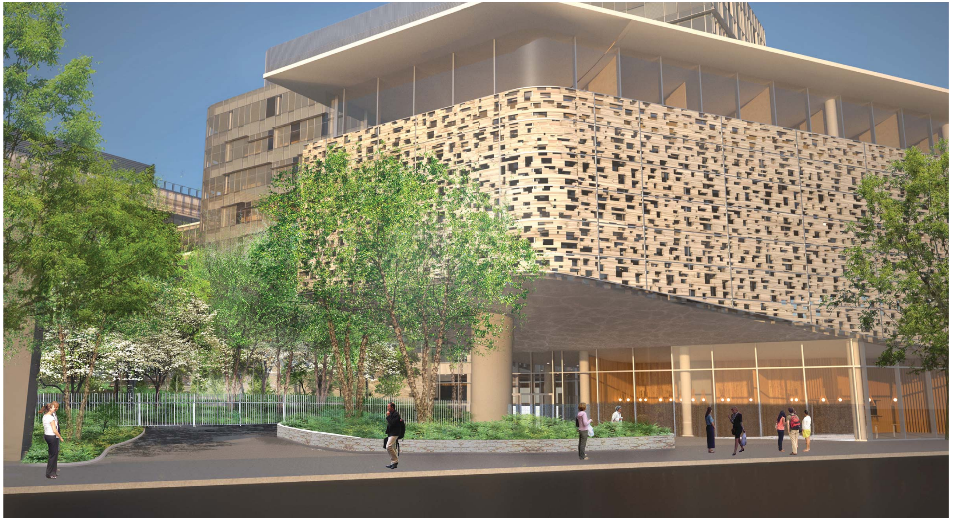
Novartis Institutes for BioMedical Research | Massachusetts Avenue Entry Plaza | View 1 (Closed) Michael Van Valkenburgh Associates, Inc., Landscape Architects 21 August 2012