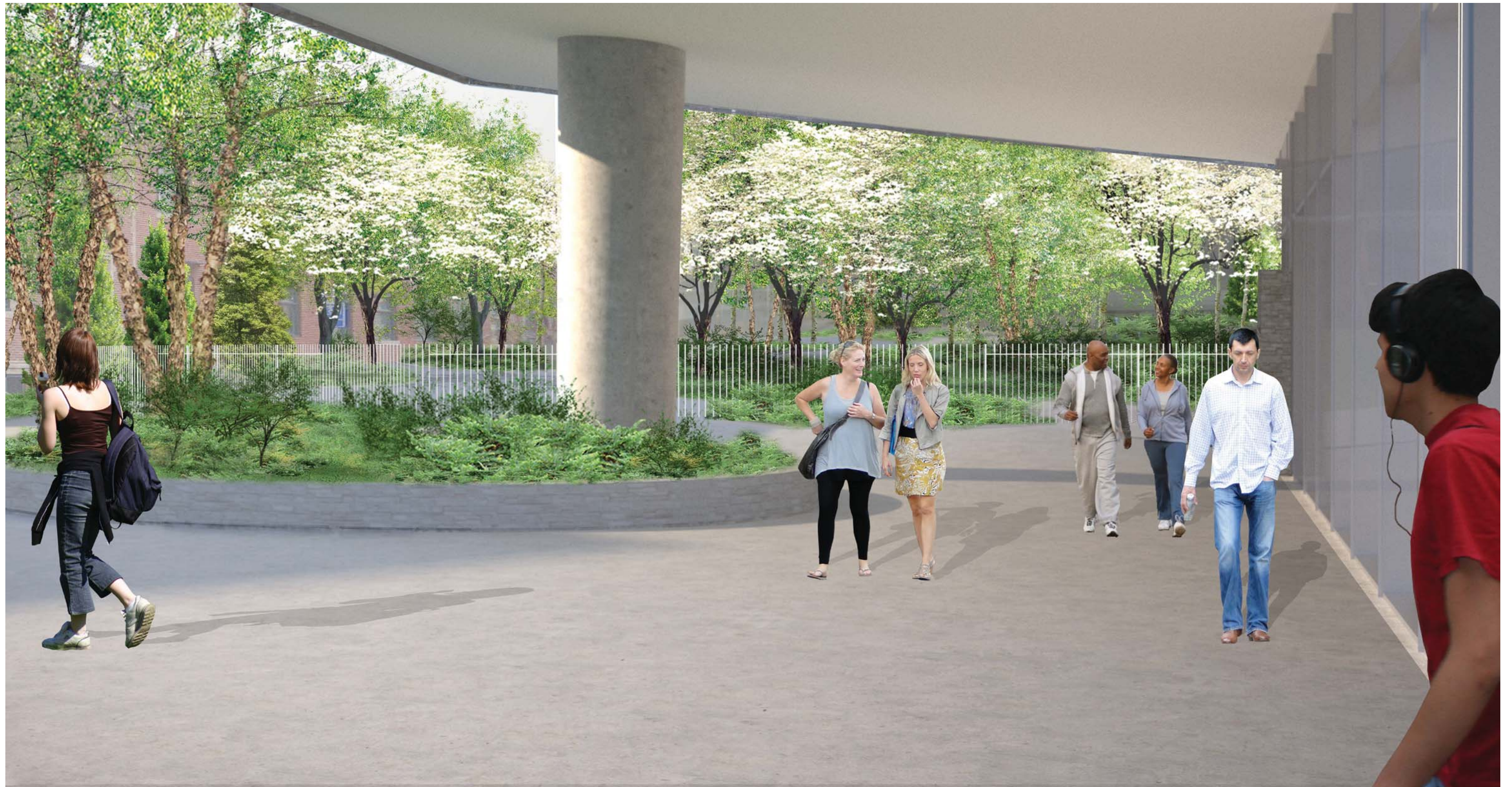
Novartis Institutes for BioMedical Research | Massachusetts Avenue Entry Plaza | View 2 (Closed) Michael Van Valkenburgh Associates, Inc., Landscape Architects 21 August 2012