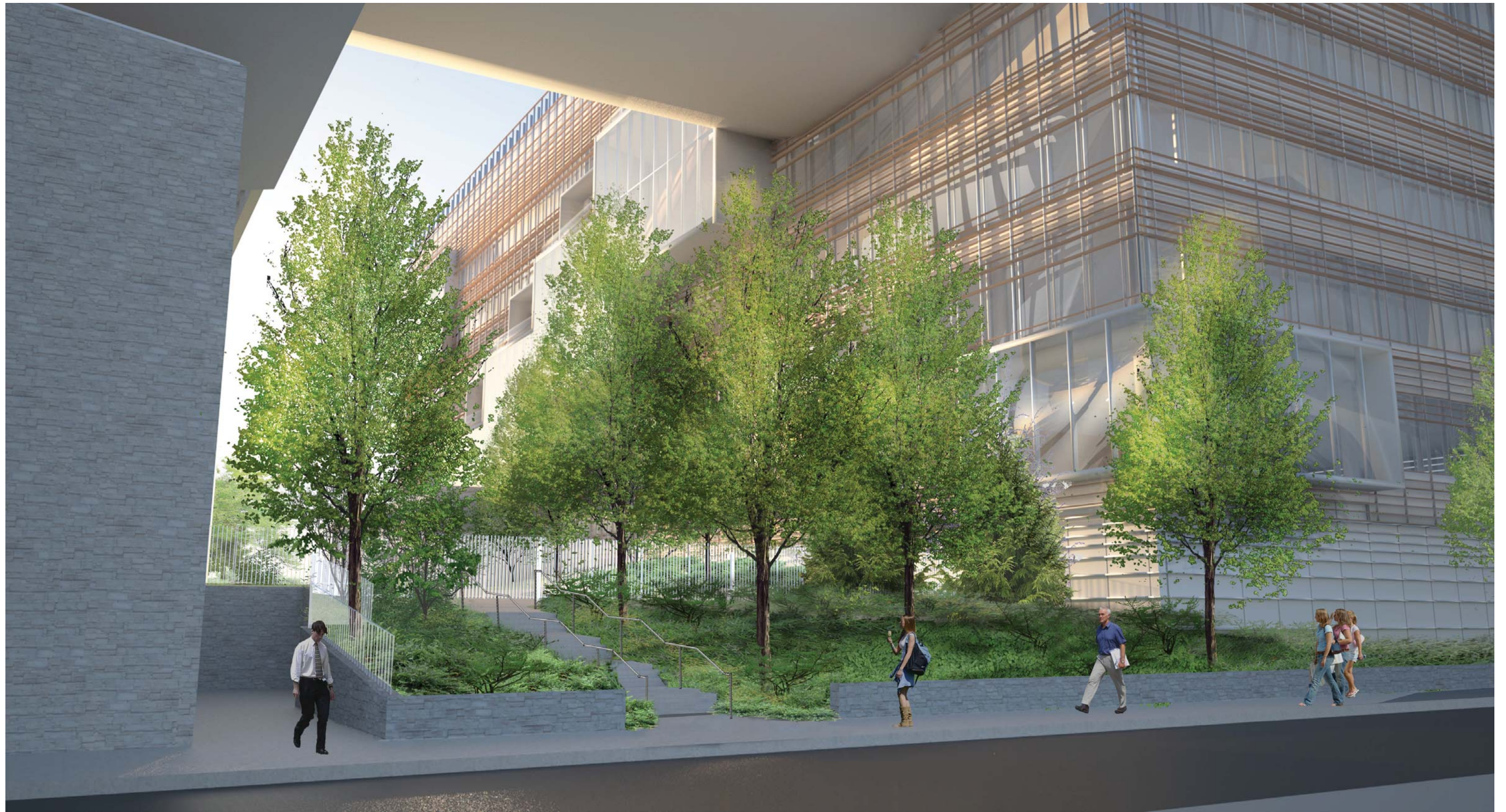
Novartis Institutes for BioMedical Research | Osborne Street Entry | (Closed) Michael Van Valkenburgh Associates, Inc., Landscape Architects 21 August 2012