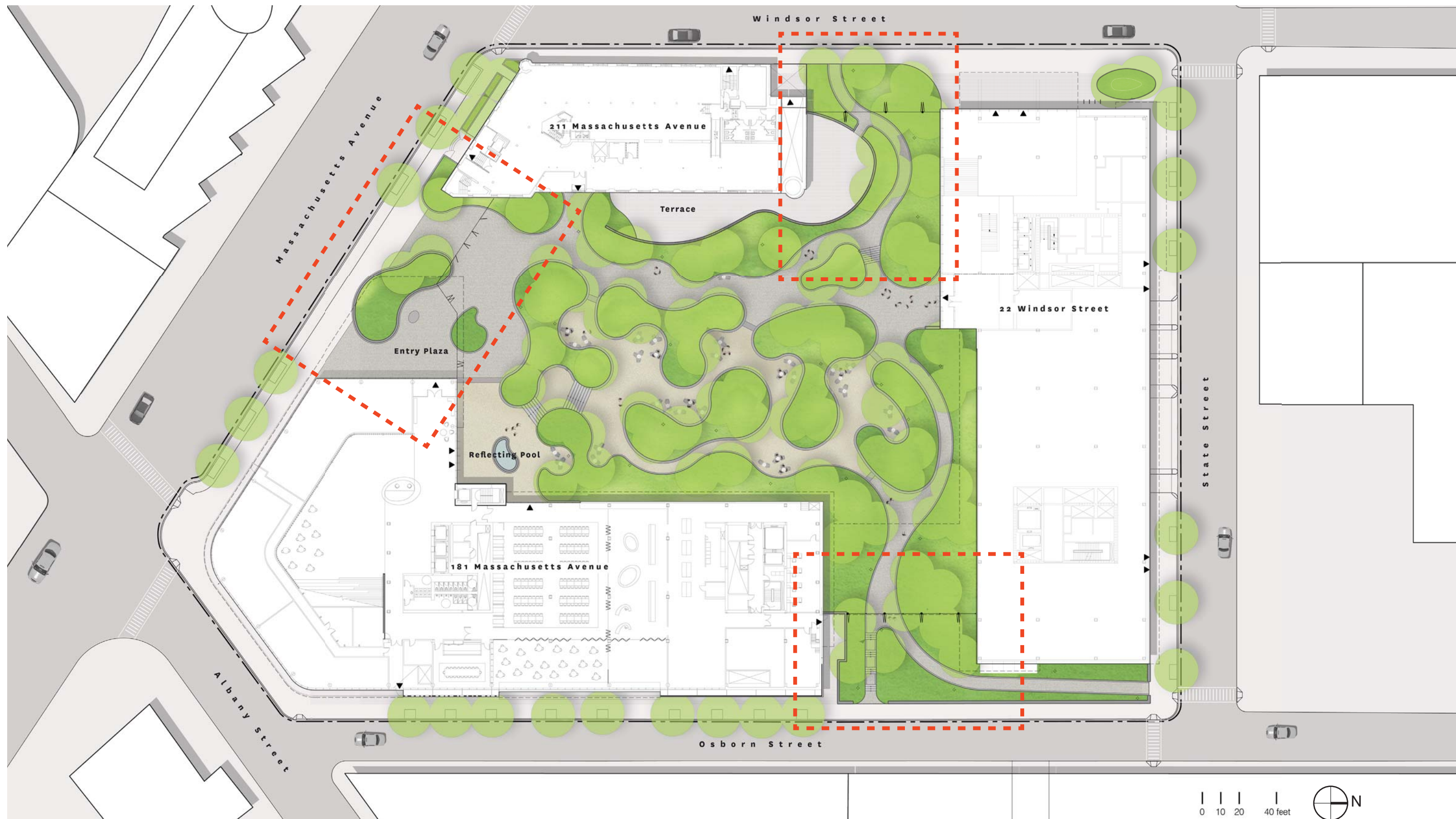
Novartis Institutes for BioMedical Research | Site Plan Michael Van Valkenburgh Associates, Inc., Landscape Architects 21 August 2012