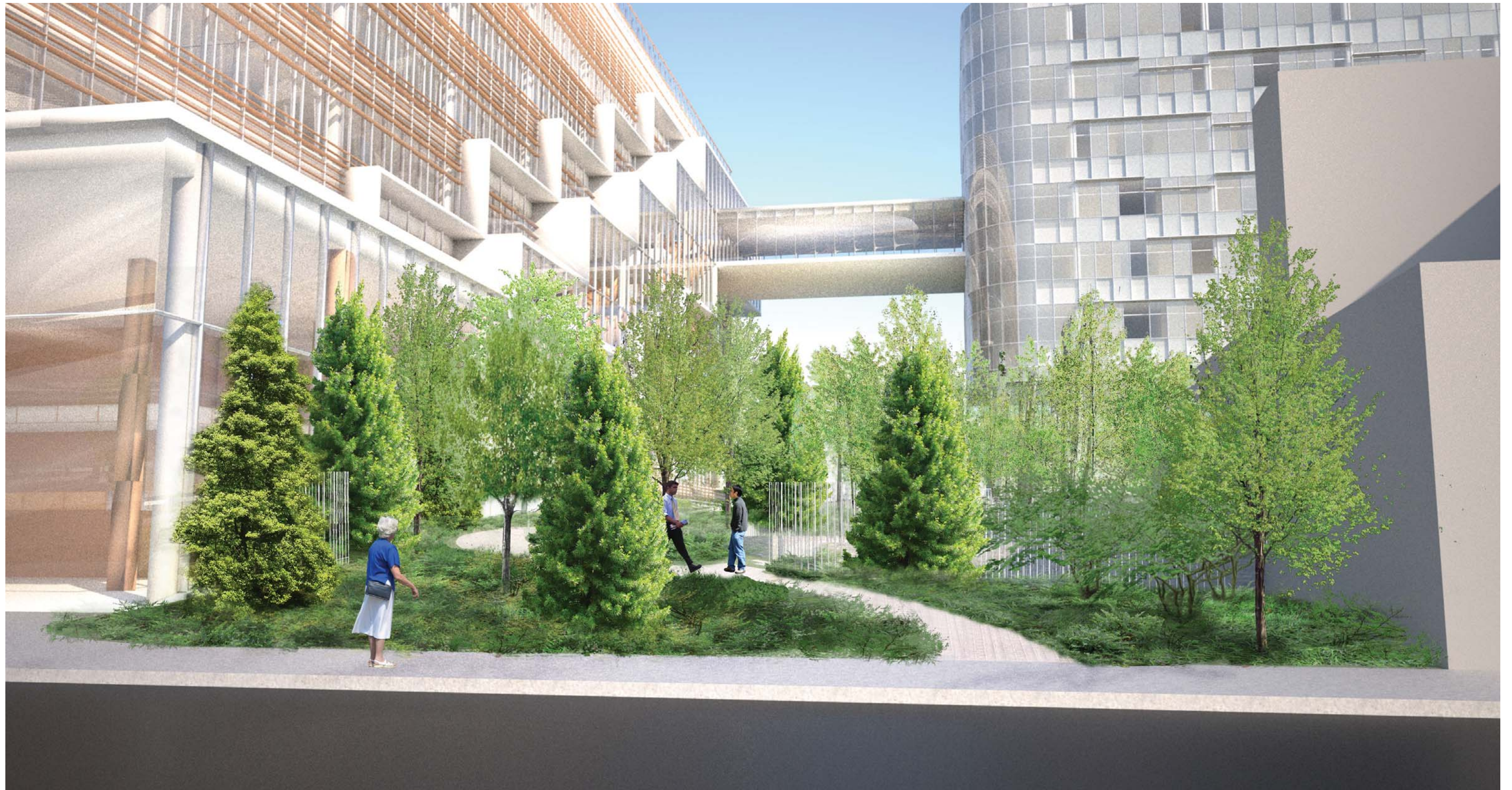
Novartis Institutes for BioMedical Research | Windsor Street Entry | Daytime (Open) Michael Van Valkenburgh Associates, Inc., Landscape Architects 21 August 2012