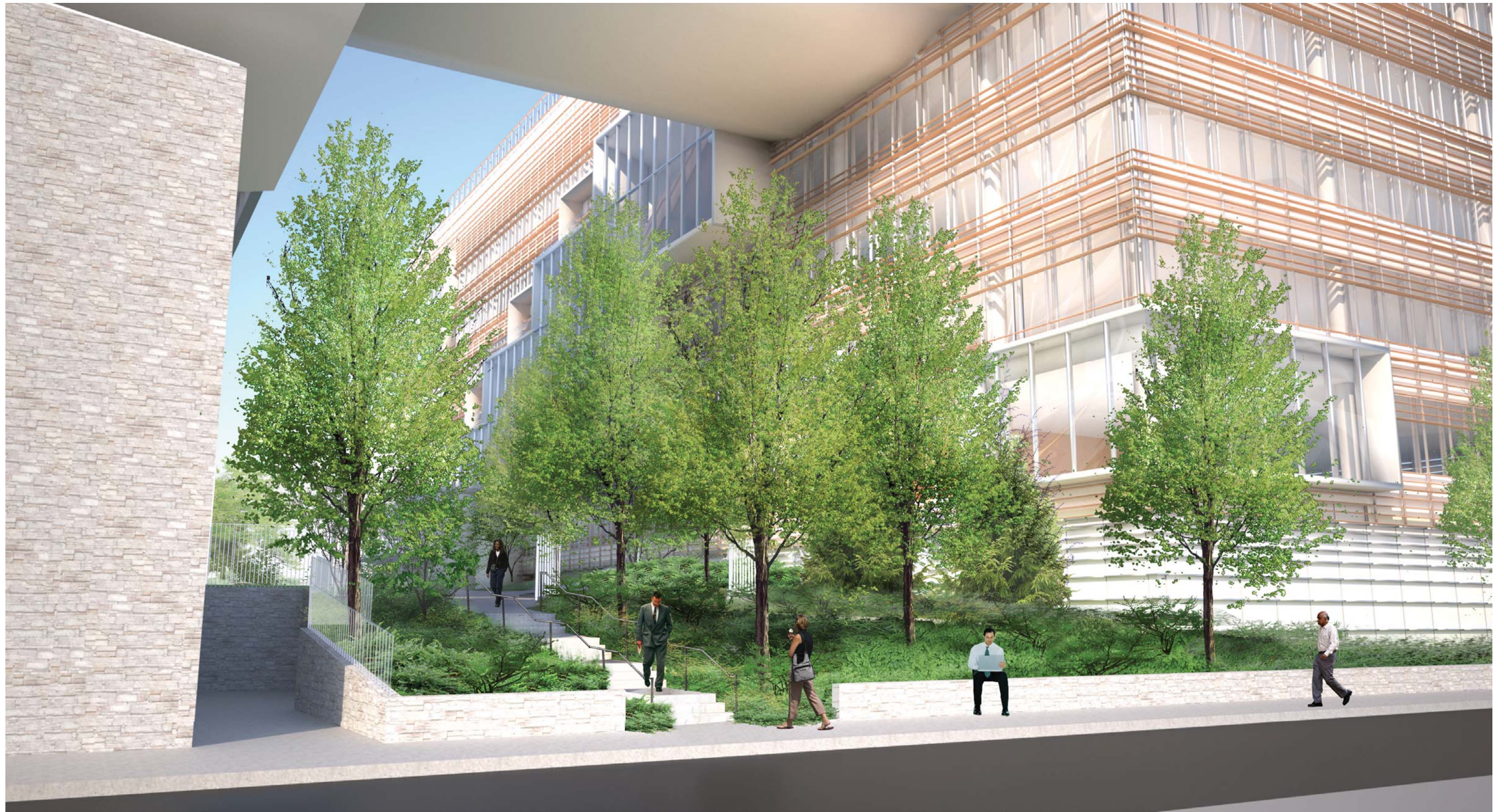
Novartis Institutes for BioMedical Research | Osborne Street Entry | Daytime (Open) Michael Van Valkenburgh Associates, Inc., Landscape Architects 21 August 2012