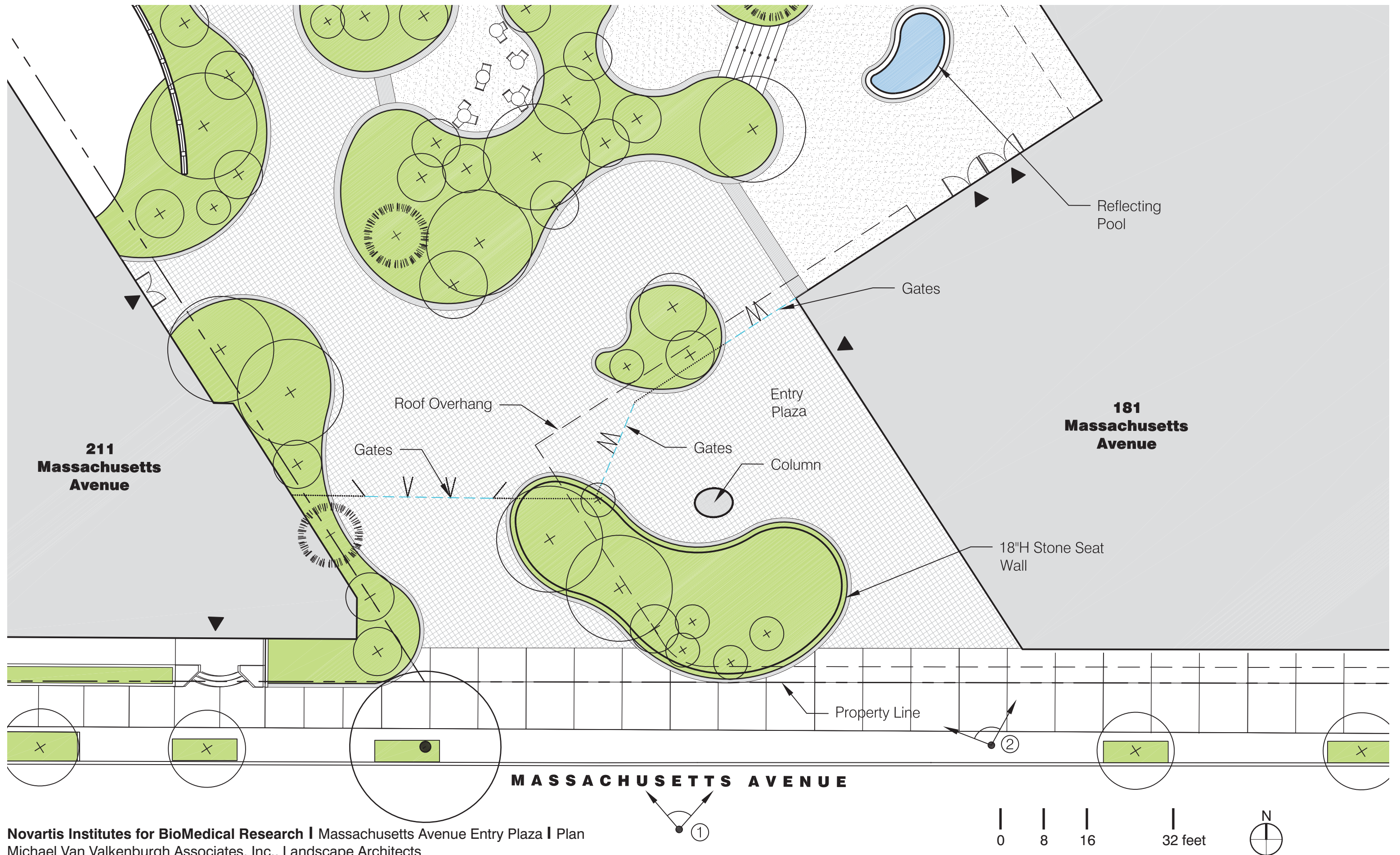
Novartis Institutes for BioMedical Research | Massachusetts Avenue Entry Plaza | Plan Michael Van Valkenburgh Associates, Inc., Landscape Architects 21 August 2012