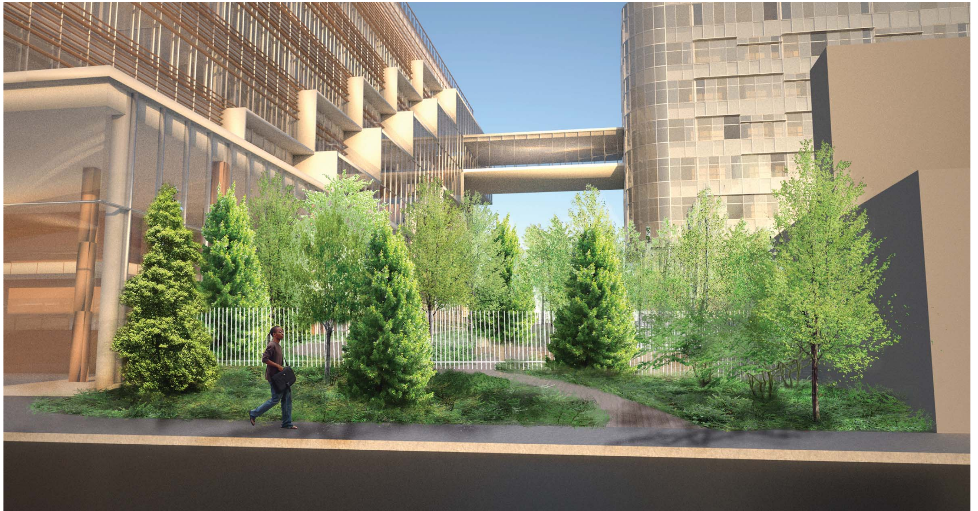
Novartis Institutes for BioMedical Research | Windsor Street Entry | (Closed) Michael Van Valkenburgh Associates, Inc., Landscape Architects 21 August 2012