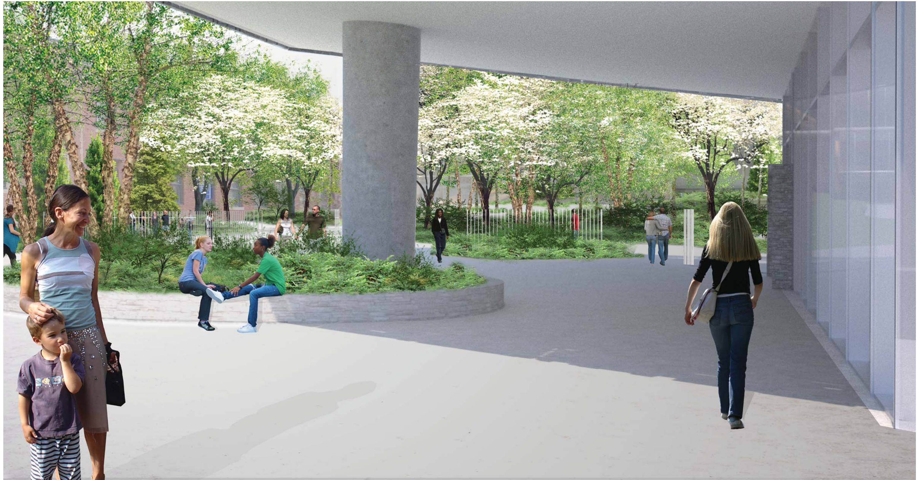
Novartis Institutes for BioMedical Research | Massachusetts Avenue Entry Plaza | View 2 (Open) Michael Van Valkenburgh Associates, Inc., Landscape Architects 21 August 2012