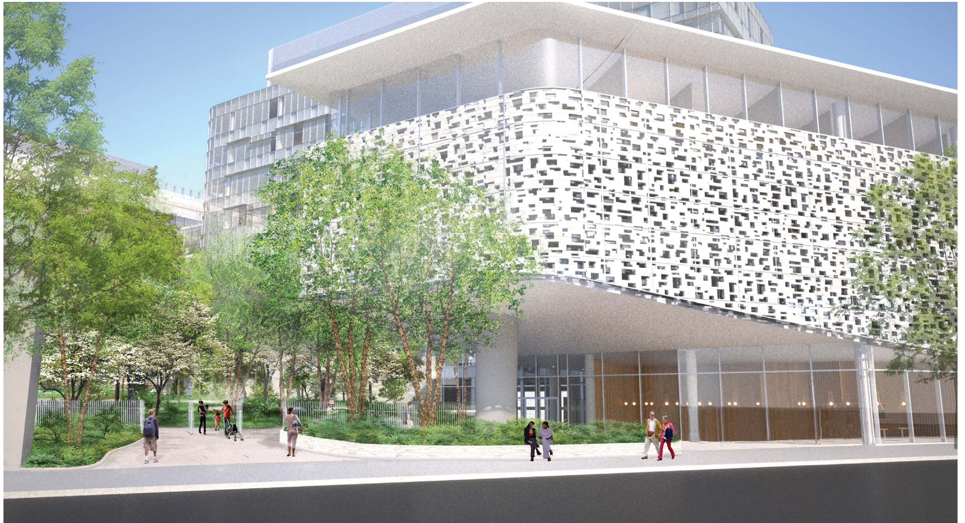
Novartis Institutes for BioMedical Research | Massachusetts Avenue Entry Plaza | View 1 (Open) Michael Van Valkenburgh Associates, Inc., Landscape Architects 21 August 2012