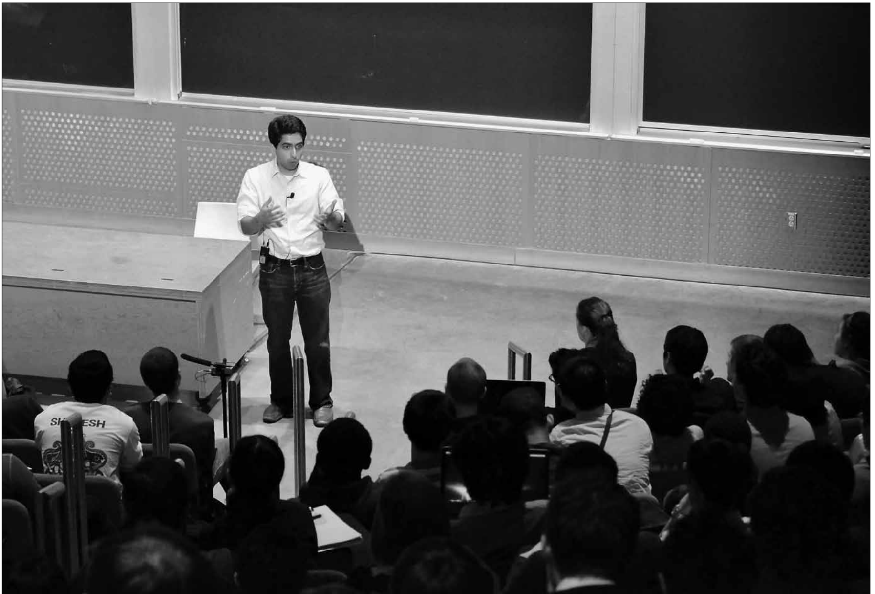
Salman A. Khan '98, founder of Khan Academy, gives a lecture entitled "Rethinking Learning" to an overflowing lecture hall in 32-123 on Thursday. Khan, a former hedge fund analyst, has created 2,800 short video lectures that have drawn more than 90 million views on Khan Academy's YouTube channel.