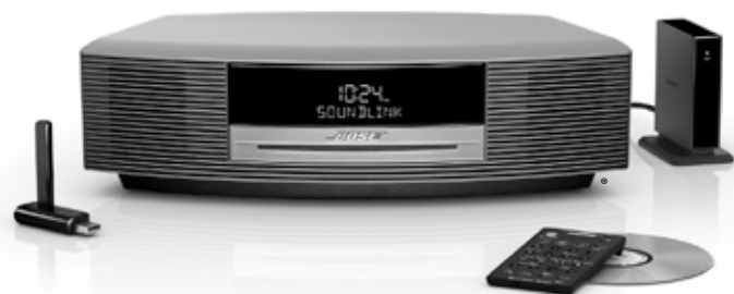
Bose Wave® music system - SoundLink®

Receive savings on most Bose® products, including the acclaimed Wave® music system, home entertainment systems, headphones, and solutions for today's most popular portable music devices.