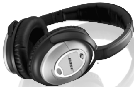
QuietComfort 15® Acoustic Noise Cancelling headphones