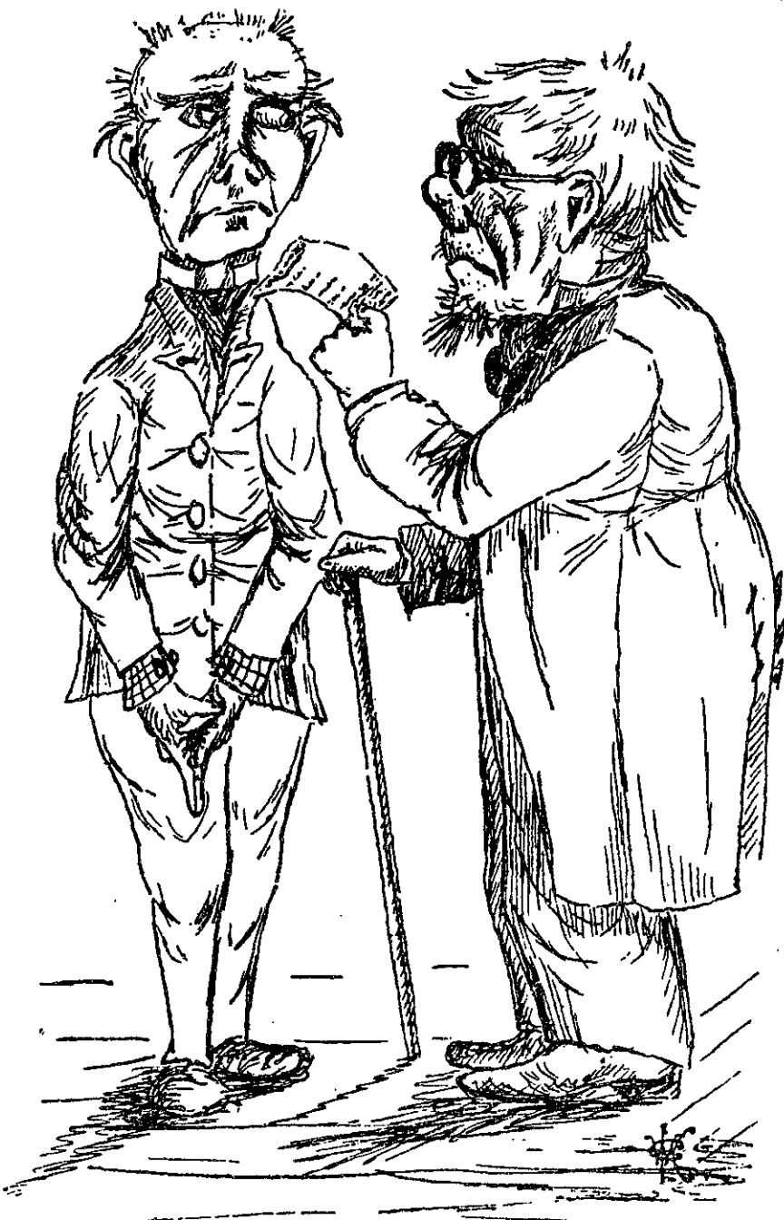
THE REPORT COMES HOME.

along the work which they have done before him; and how helpful as clues for work are the examination papers of years filed carefully away for the benefit of future members, together with the papers on mining topics read before the society by its various members! Setting aside the social enjoyment of the members at their initiations, meetings, and suppers, are not these advantages derived by membership